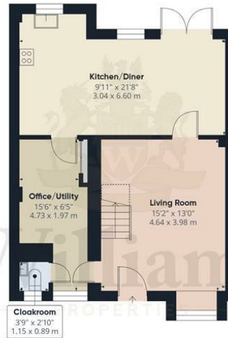
Floor 0 Building 1