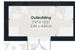
Floor 0 Building 2