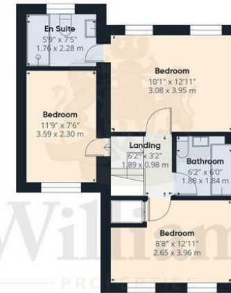
Floor 1 Building 1